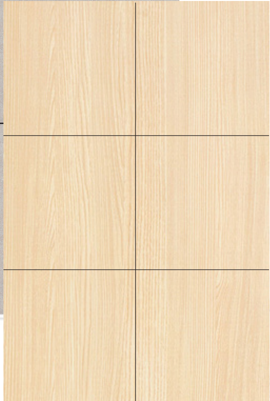
Artistic Rendering. Solid Island Ceiling faced with Formica® Aged Ash 8844 and LED perimeter lighting.

Our ceilings are hung from the canopy with our concealed steel bracket system and hardware. Our easy-install bracket system and detailed instructions provide you with a quick and hassle-free installation.